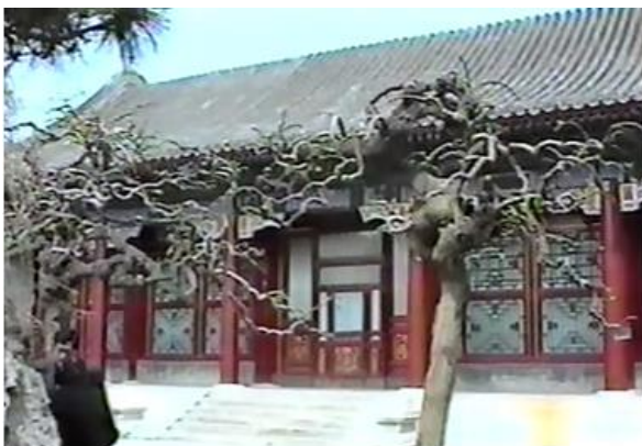
TEMPLE WITH UNIQUE TREES

Lanzhou again presented stark scenery, with deep gullies and sharply etched hills into which the adobe houses seemed to be absorbed. It was still cold, and en route to the city I visited a village cloaked in early morning mist, where men led donkeys beside a frozen stream and bare trees; the only other inhabitants I saw were a black pig, a dog and chickens. The waterway widened to a captivating vista of shining ice ‘flowing’ between sheer amber-coloured canyon walls with hills beyond. Surrounded by a few pines, a hilltop pavilion was an attractive sight, and my first view of the city was across the wide swiftly moving Yellow River – second longest after the Yangtze, travelling an incredible 5,464km (3,395 miles) – with the curled eaves of pavilions amongst the mud-brick and stuccoed buildings and a monument on a hill behind. As I paused to take photographs from a bridge, a man crossed with a pole bearing baskets laden with bright red chillies – a startlingly colourful intrusion on the drab surroundings.