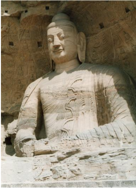
YUNGANG GROTTO, DATONG

Buddhist statues and basreliefs, the largest being the 17m (another source said 13.4m/44ft) seated Sakyamuni Buddha , with the familiar inscrutable but slightly amused expression. Lions graced the entrance to an ornate multilevel wooden pavilion built right into the cliff, its intricate eaves supported by verandah posts adorned with the antlered heads of gruesome mythical creatures. Snow lay on the ground, the curved roofs, and the mountaintop, and an attendant was clearing the latest fall from pathways to the caverns as I approached the most impressive, its entrance defined by substantial rock-hewn pillars. This contained a wealth of images on a red and blue background; larger figures with beautiful turquoise headdresses and sashes occupied recesses. Amongst the small figures were many-armed images like the Hindu god Shiva, and other caves housed several towering Buddhas with elongated earlobes, a couple with faint blue colouring on the dress. Smaller more-exposed unadorned niches and the statues they contained were without any colour but looked awesome against the lovely azure hue of the sky above. Altogether, the grottoes were an outstanding demonstration of devotion.