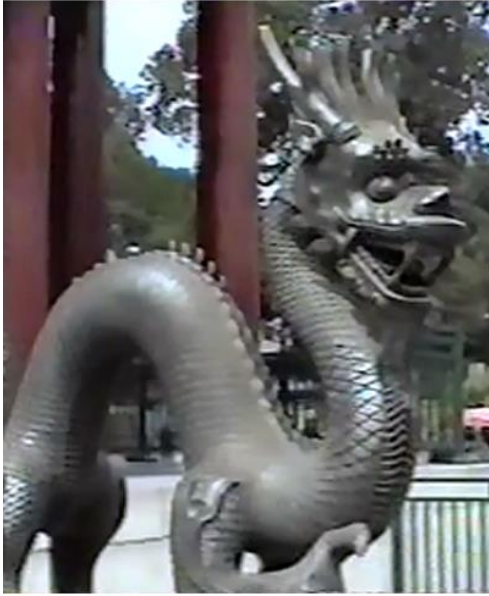
DRAGON SCULPTURE, FORBIDDEN CITY

rooms (actually a misconception) in 800 buildings and covered an area of 180 acres. On top of an unusual carved column, a dragon stood guard before a bridge to the main Gate of Heavenly Peace , still with a portrait of Chairman Mao overhead. Inside the gate, I photographed the buildings through arches and the beautiful lacework of bare branches. A series of white marble bridges led to pavilions in front of which sat large metal lions wearing the green patina of aged copper. As distinct from summer, when crowds flew kites in the main square outside the walls, there were few people in the immense snow-carpeted courtyard. Steps flanking a mammoth sculpted panel featuring dragons in high relief, led to more pavilions, and other large metal objects included a crane or heron, a turtle, lanterns, and huge gleaming bowls. Doors were embossed with delicate gilding, and carving beautified tops of marble railing. A red wall with green enamelwork was located behind a golden lion, the claws of its right paw clutching a gold orb, and tiny animals decorated roof ridges, but for such an enormous and important venue it was surprisingly simple. The white stupa of Beihai Park was visible over rooftops, and gnarled trees surrounded pavilions that graced the city's gardens at the rear. Flowers, animals and leaves were etched into paving, and a kneeling copper or brass elephant guarded the exit. The Palace Museum is described more fully in the later chapter on China.