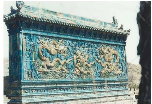
THREE DRAGON WALL, DATONG

En route to visit a monastery, I stopped to photograph a blue tiled, three dragon wall, a glaring addition to the drab surroundings. Considered to bring good fortune, these were also a familiar part of Chinese culture and varied in size, but always with an odd number of dragons. Surrounded by snow and bare trees, a redwalled temple complex contained a blue wall with seven gilt dragons, which I filmed through a circular opening. Sadly, again I was unable to film any of the opulent interiors.